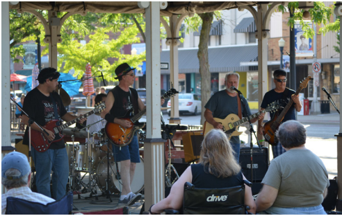
Summer Concert Series