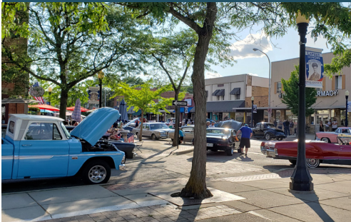
Monday Night Cruise on Nepessing Street