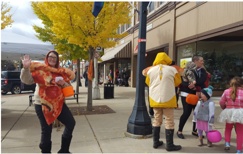
Annual Halloween Treat Walk