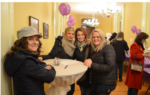
A Ladies Night Out in historic Lapeer