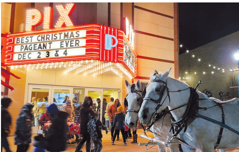
Annual WinterFest Celebration