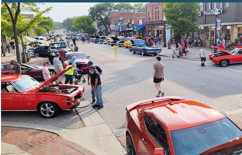
Lapeer Cruise on Nepessing Street