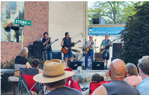
Summer Concert Series