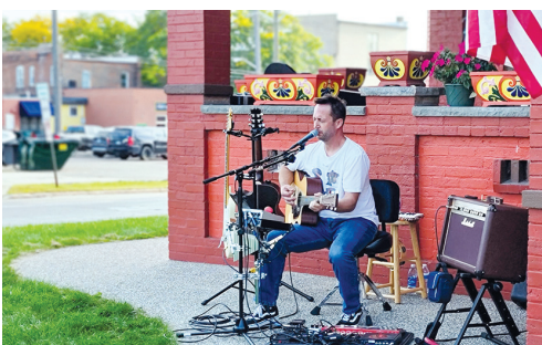
Lapeer's Second Annual PorchFest

“By using the tools and resources given to us through Michigan Main Street, we are able to turn someone’s aspirations and goals of opening a brick-and-mortar business, into their American Dream.”